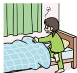
go to bed

Q4: I ふ だ ん usually go to bed at ___ p.m.